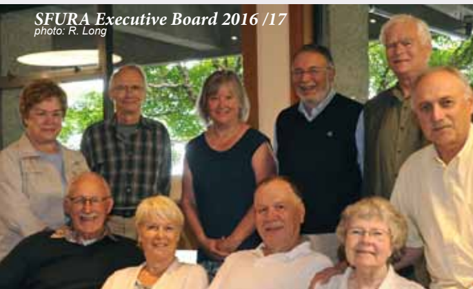
SFURA Executive Board 2016 /17